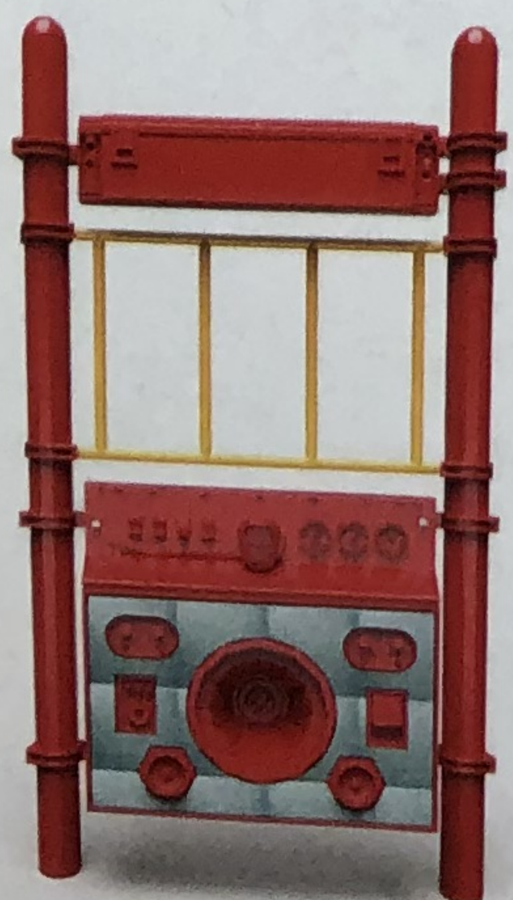
Pumper Panel Assembly