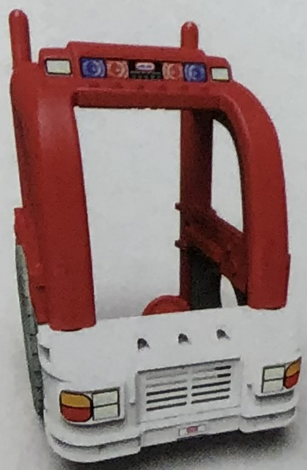
Fire Truck Cap Assembly