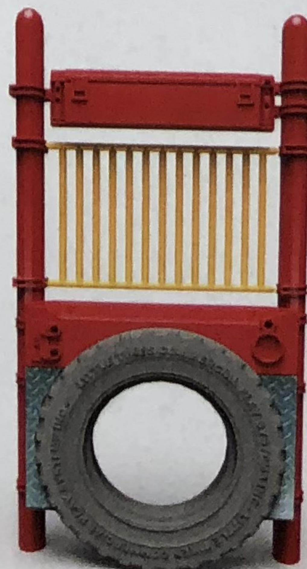
Tire Panel Assembly K