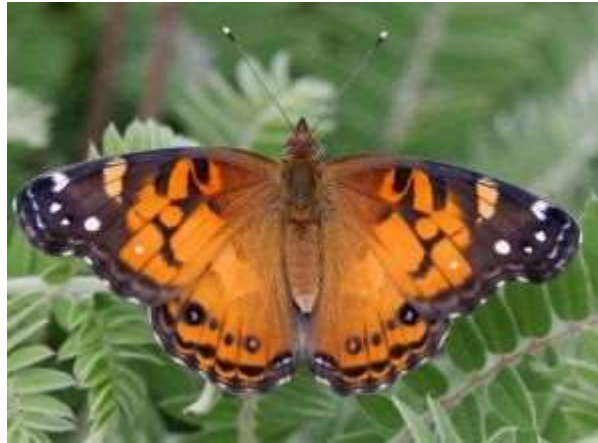
American Painted Lady